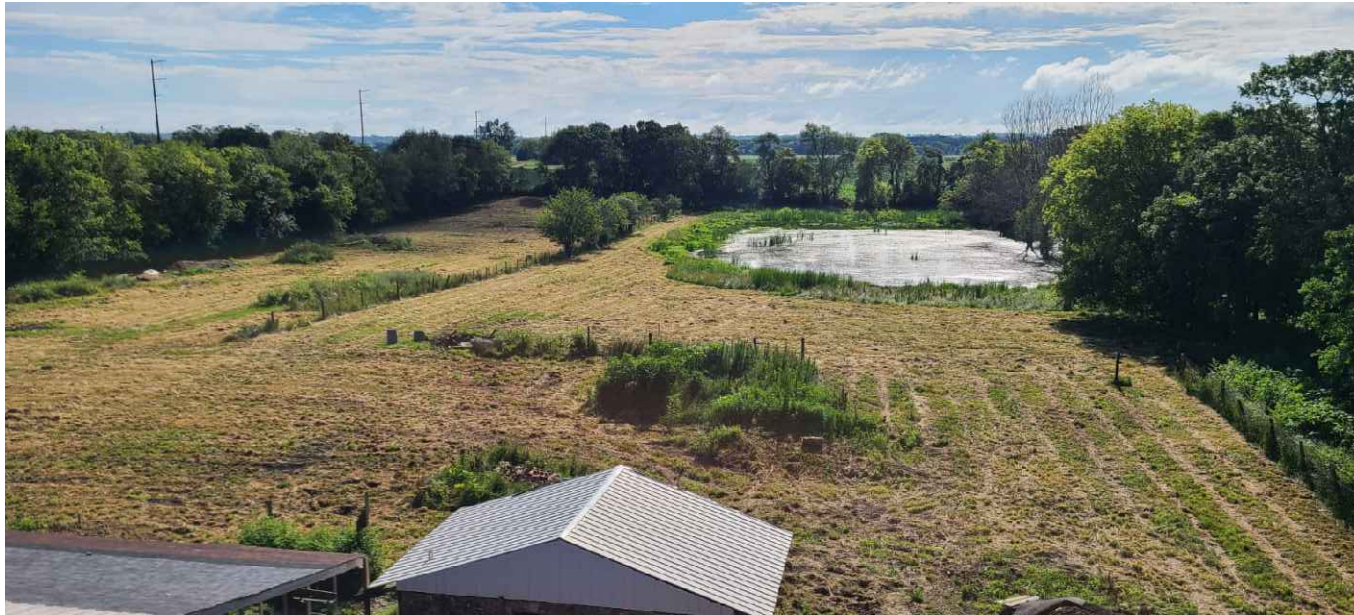
9. North, east and south property lines