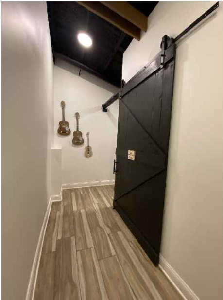
9. Approach to men's restroom