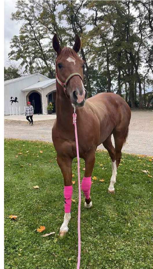
10. Chestnut with pink