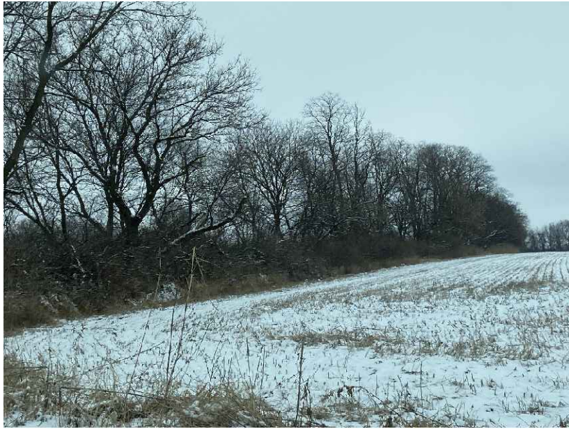
1. South property line