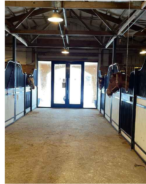
2. Stalls with horses