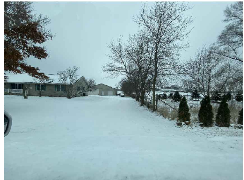
8. North property line