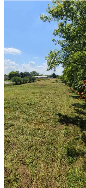
8. Westward view from eastern property