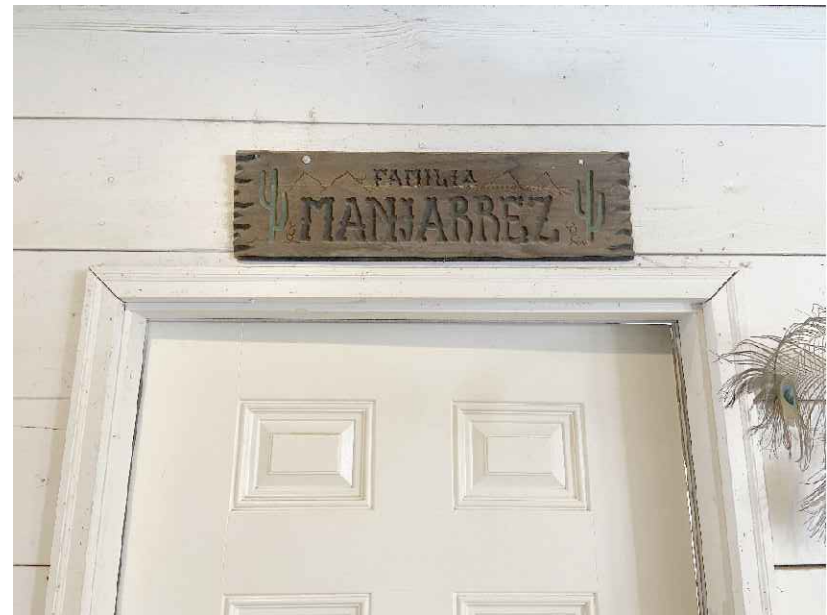
4. Family sign