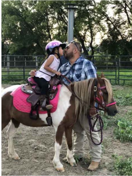
9. With dad and pony