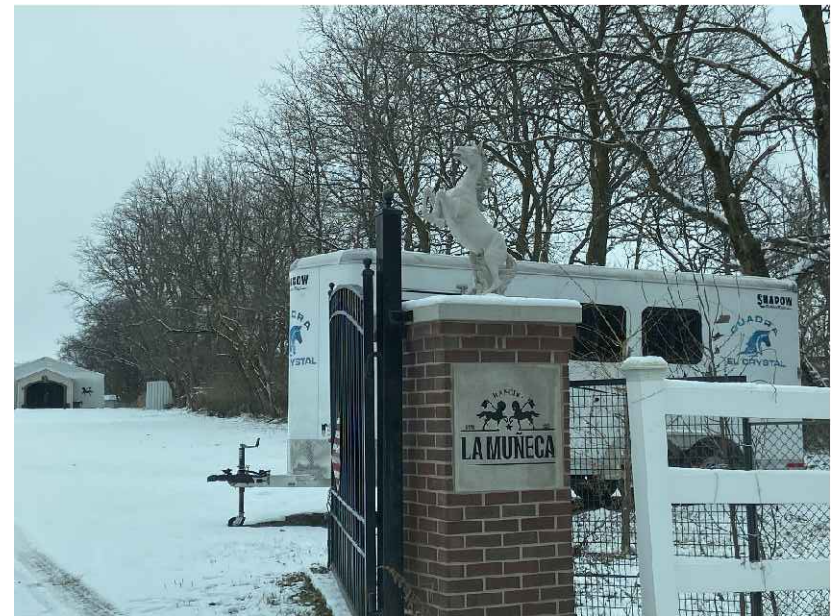
4. Entry gate pillar