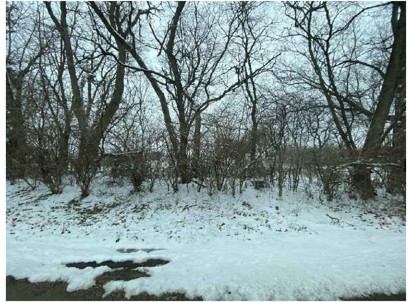
2. South property line