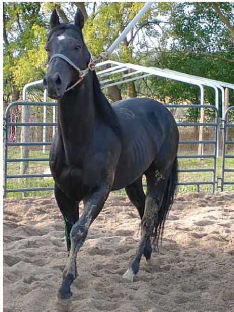
11. Black horse walking