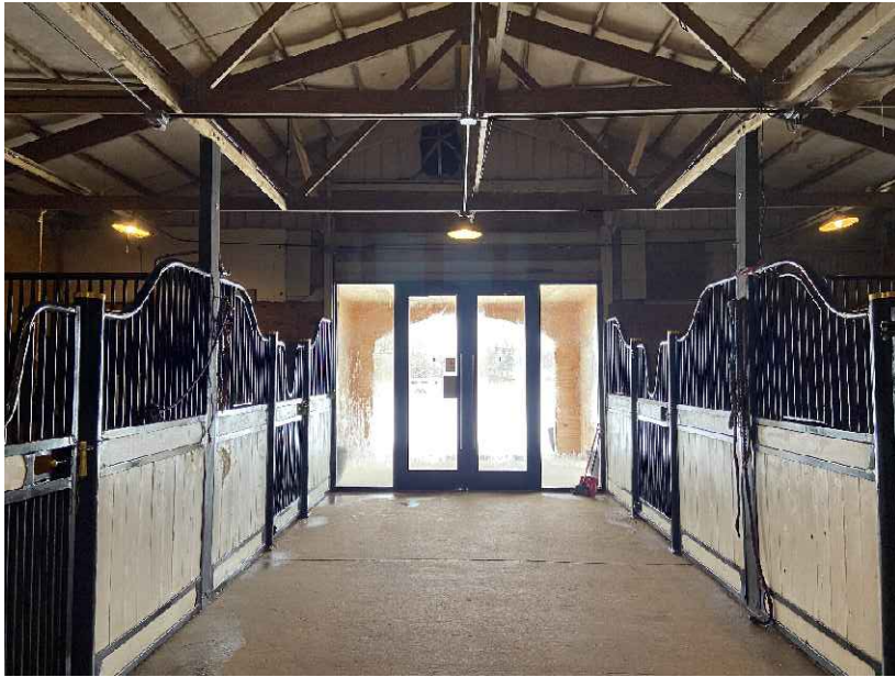
1. Toward entrance