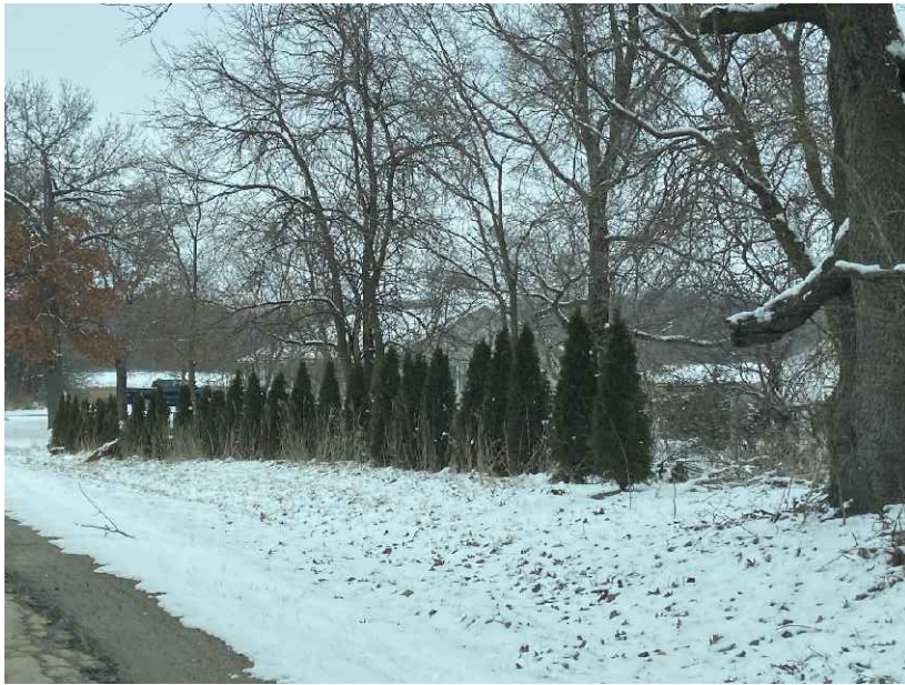
5. New evergreens along west property line