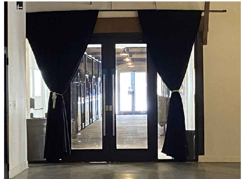
2. Entrance from stables