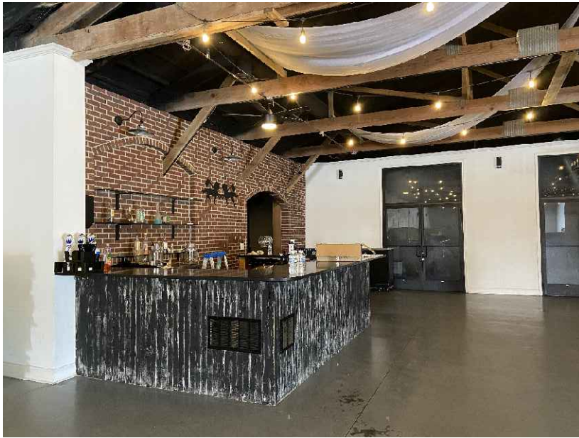
5. Dry bar