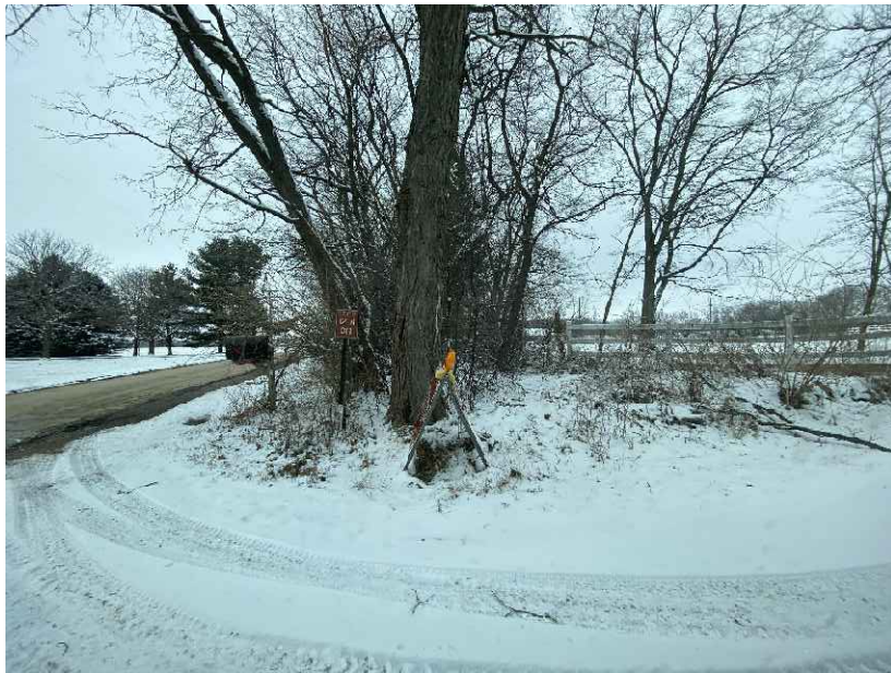
3. West property line (from entrance)