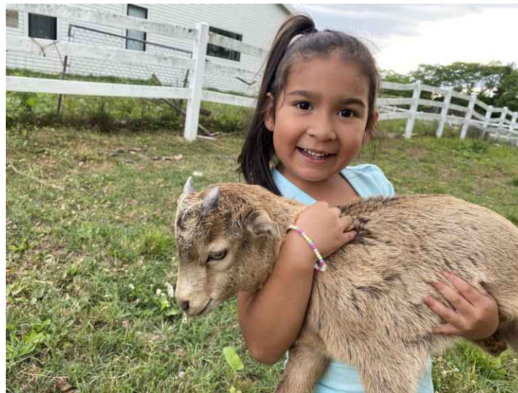
3. Baby goat