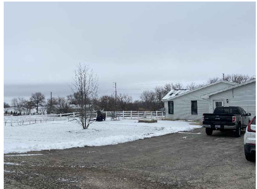
4. House from porch