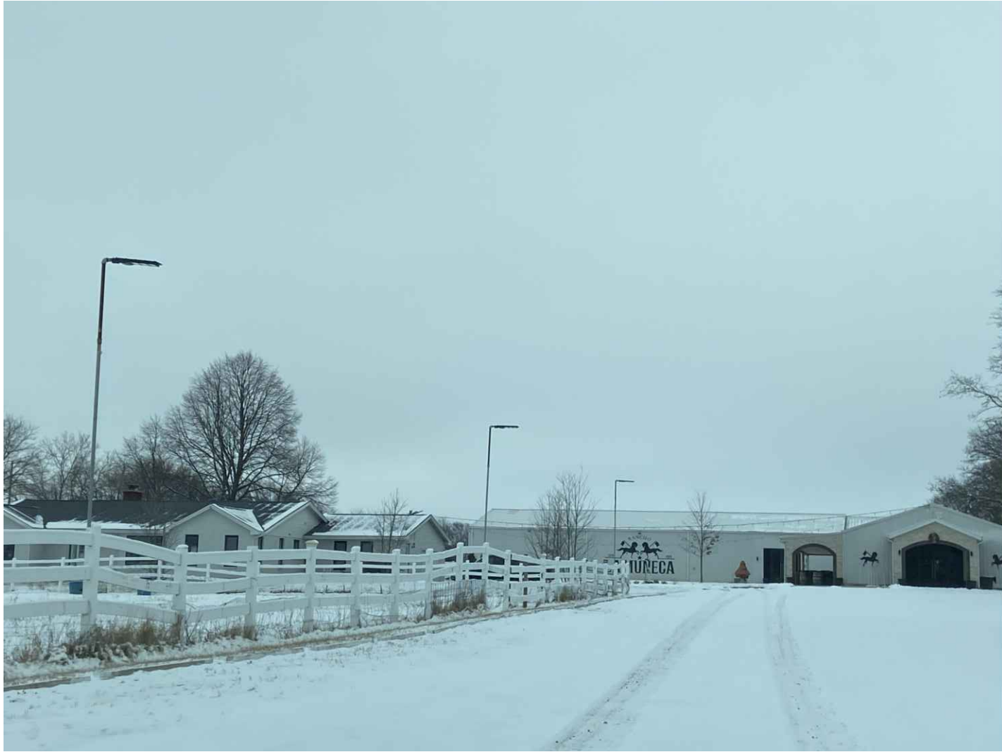
5. View into property from driveway entrance