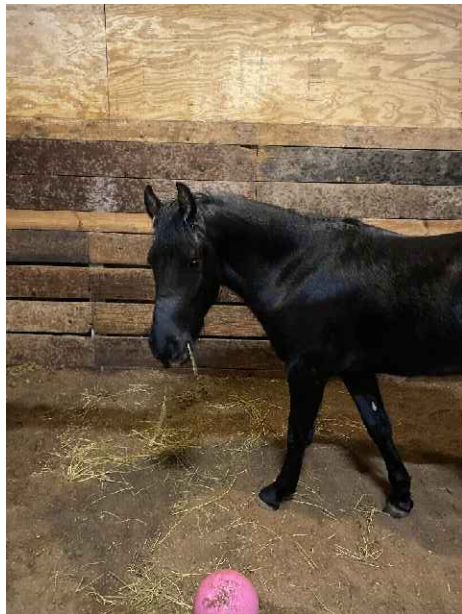
7. Horse in stall