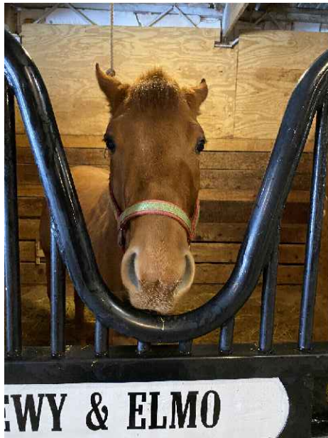
5. Horse in stall