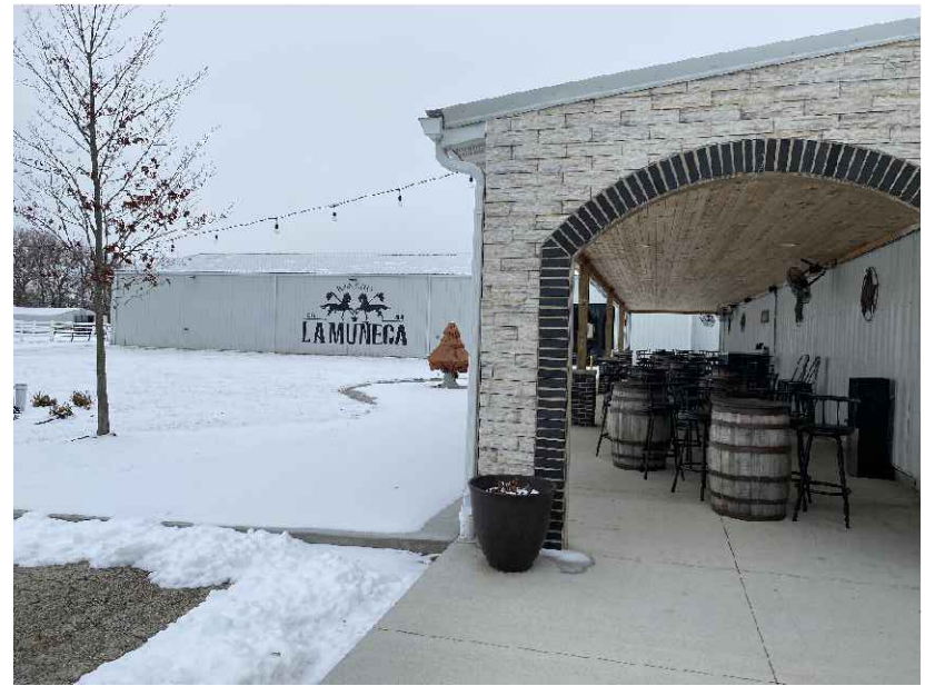
2. Porch on north side of stables