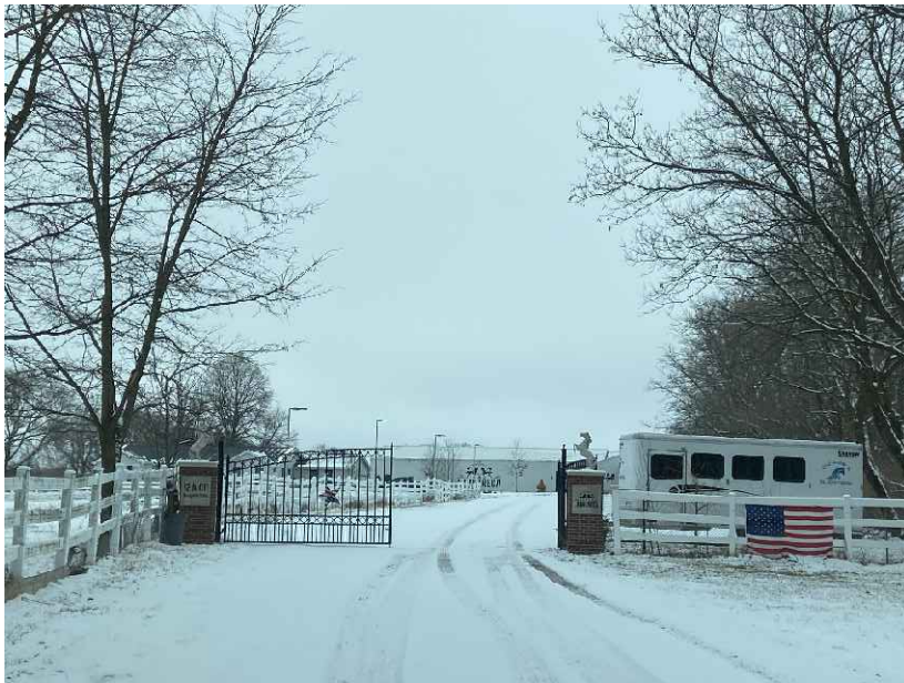
3. Entry gates