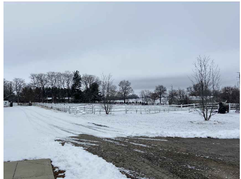
2. Front pasture