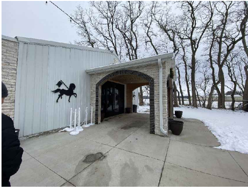
1. Entrance to stables