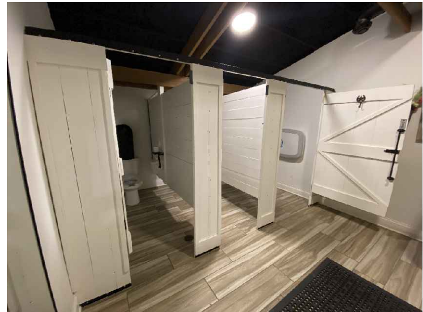
8. Women's restroom