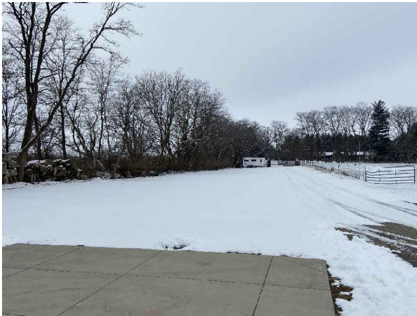
1. Looking west toward entrance