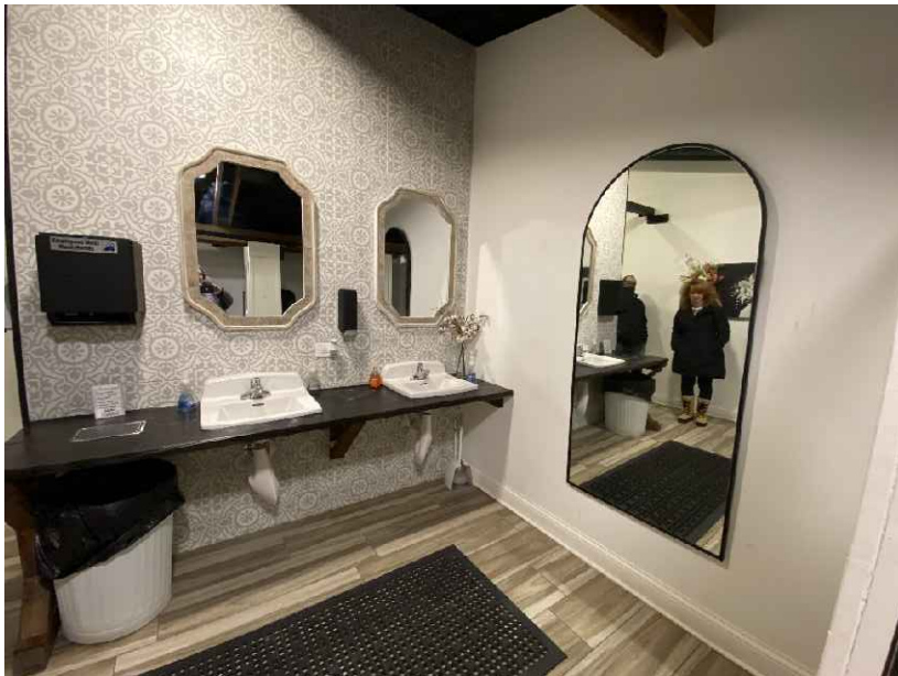
7. Women's restroom