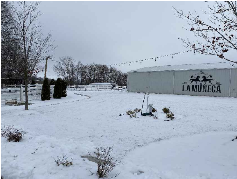
3. Main building and back barn/pasture