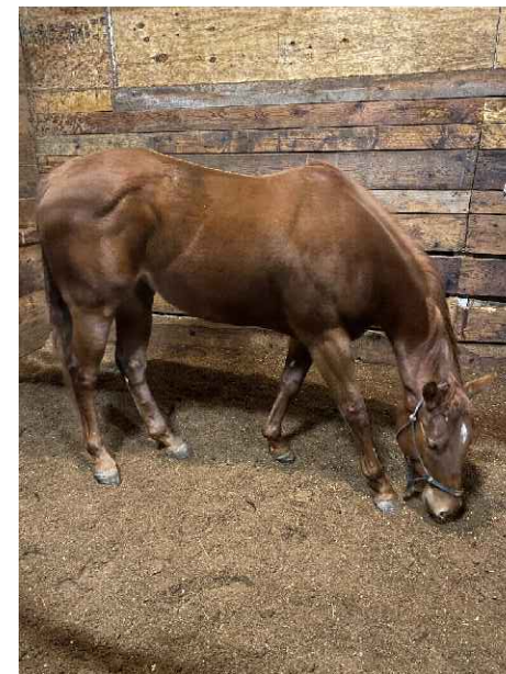
8. Horse in stall