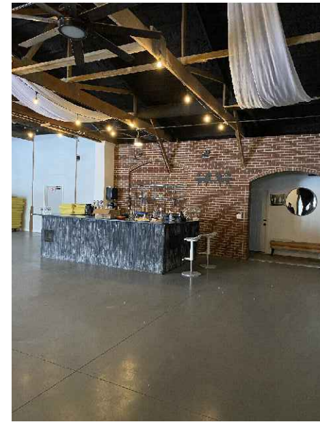
6. Dry bar and restroom entrance