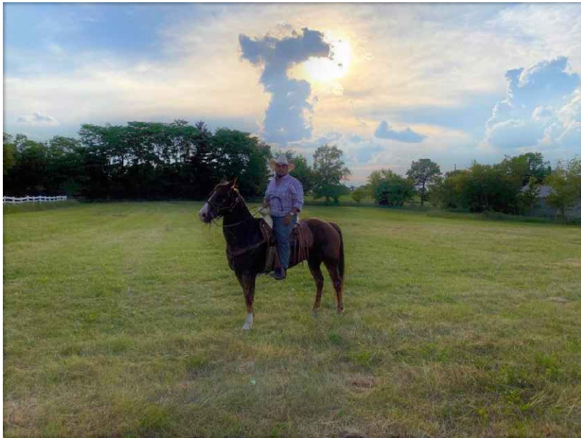
7. Front pasture