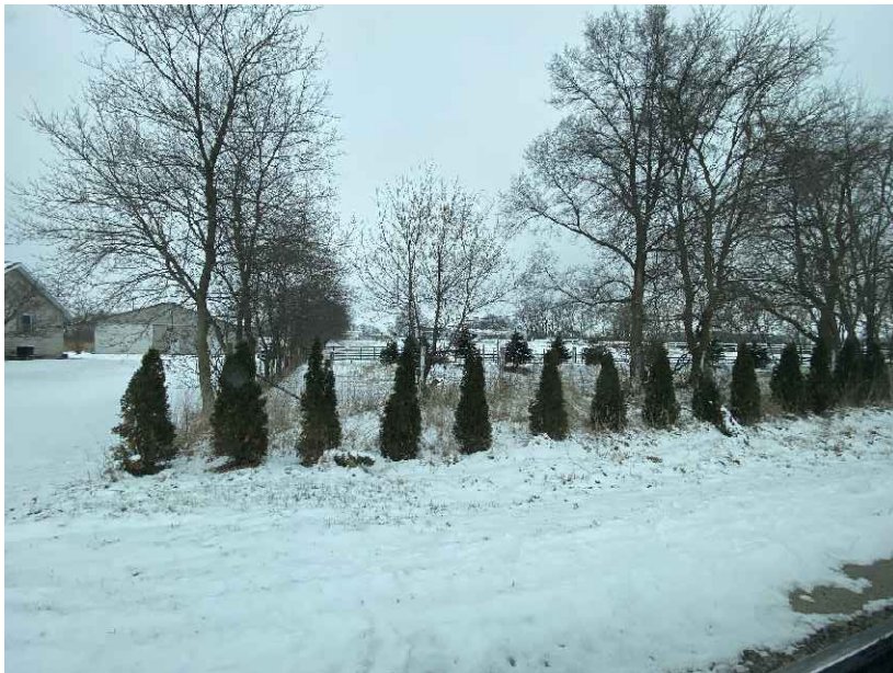
7. West and north property lines