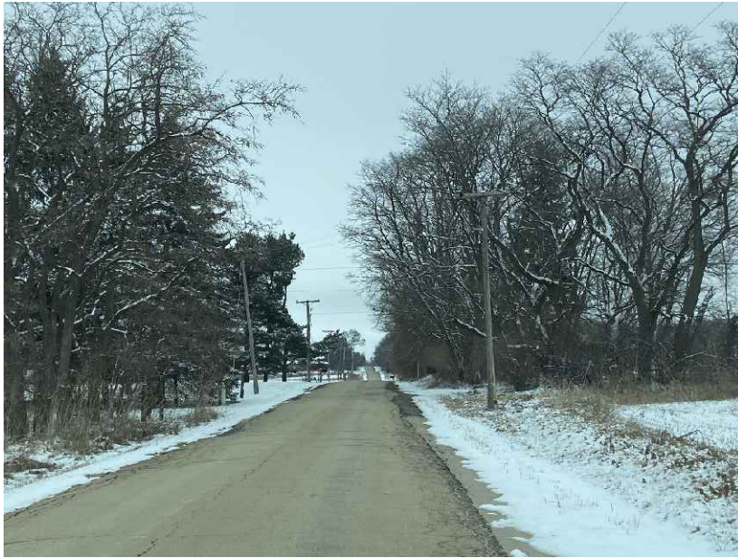
1. Approach on Waughon Rd. from south