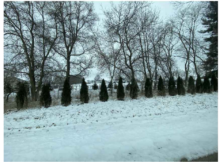
6. New evergreens along west property line