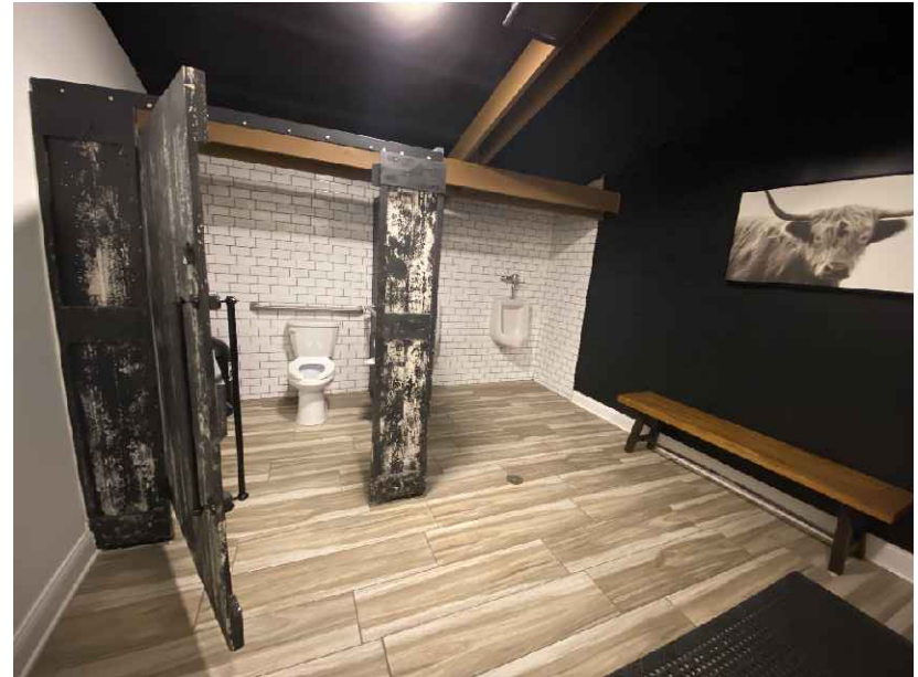
10. Men's restroom