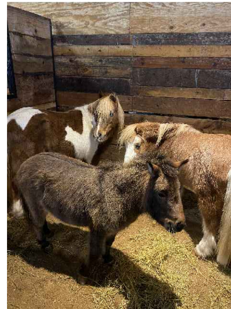
6. Mini trio