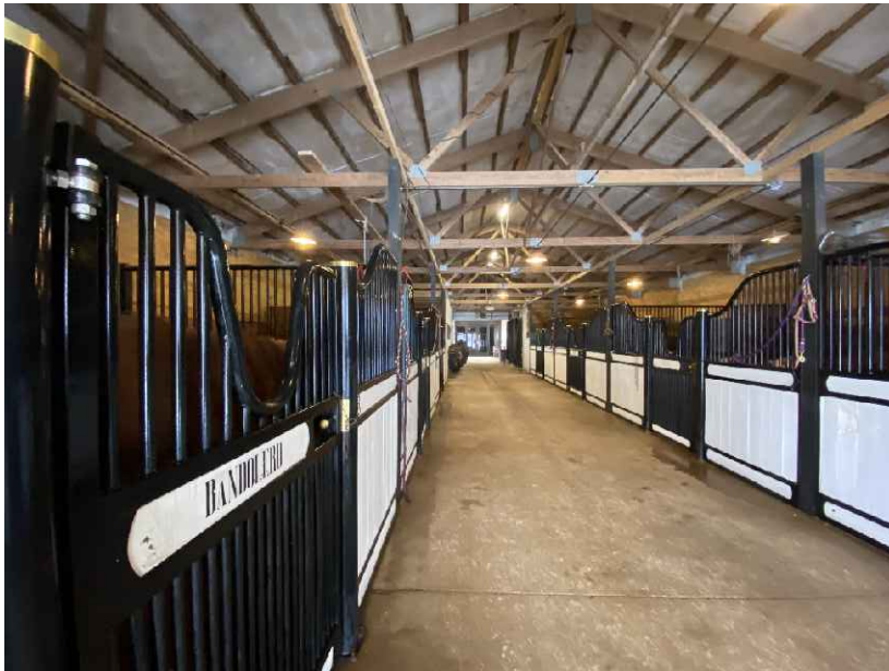
3. Toward main building