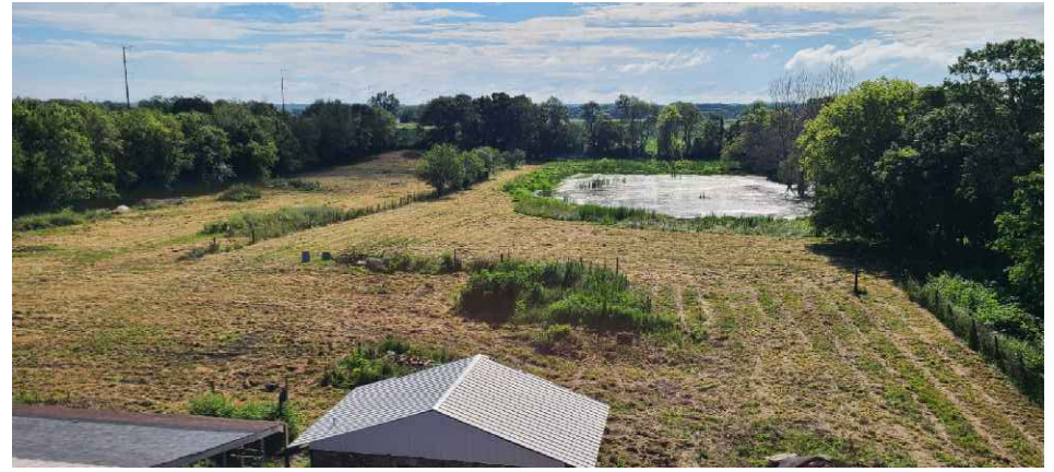
6. Eastern portion