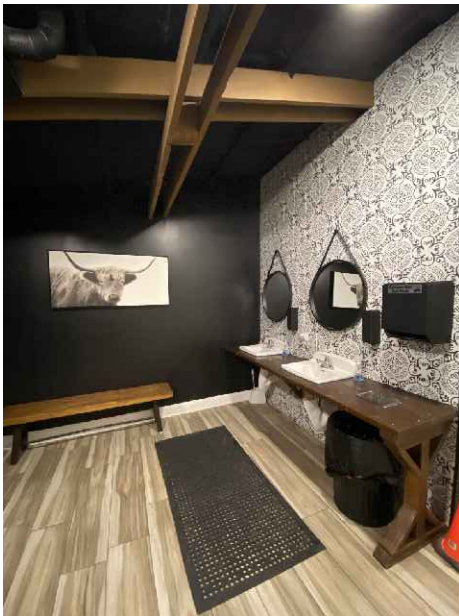
11. Men's restroom