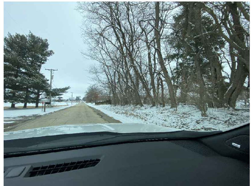
4. West property line